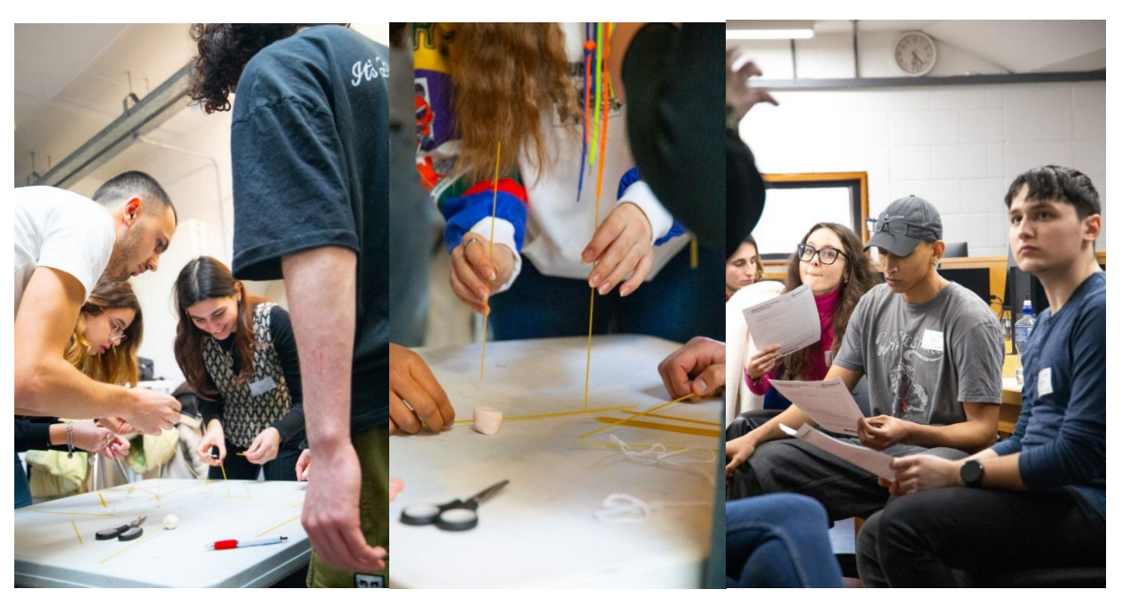
Photo 2. Montage showing 10 Days of INGENIUM Entrepreneurial Junior School teambuilding activity

This was a successful approach and enabled the students to study the challenges by working together to address the challenges presented by the industry experts. The teams developed real-world solutions for the challenges presented to them.